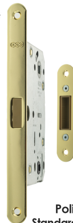
Polished Brass (PB) Standard Strike Plate Pictured